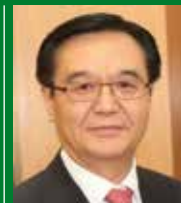
H.E. Mr Gao Hucheng Minister of Commerce of the People's Republic of China