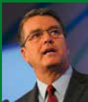
Mr Roberto Azevêdo WTO Director-General

"The book contains important discussions and analyses of a range of issues facing the WTO – specifically its African members – and the numerous challenges facing all members. ... (We) recommend this book not only as a valuable record of the WTO's success in Nairobi, but also as a timely and important contribution to the literature on sound policy-making at the international level."