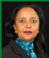
H.E. Mrs Amina Mohamed Cabinet Secretary for Foreign Affairs and International Trade of the Republic of Kenya